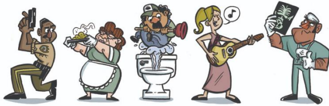
And whatever you do, in word or deed, do everything in the name of the Lord Jesus, giving thanks to God the Father through him.

siblings. If we marry, we have the vocation of spouse, and, with children, we have the vocation of parents. Our place of residence makes us citizens of our neighborhoods, cities, counties, states, and our country. Our work is a vocation. At baptism, we are given the vocation of being Christian.